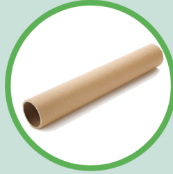
empty cardboard tubes