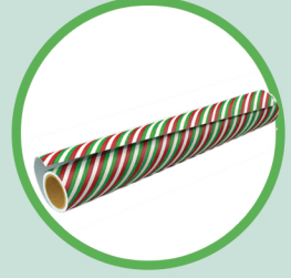
wrapping paper no metallic, glitter, or foil