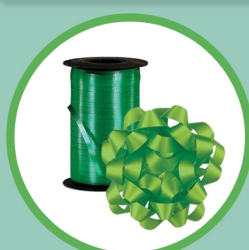
ribbon and spools