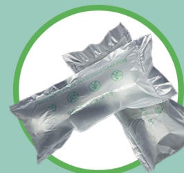
air pillow packaging*