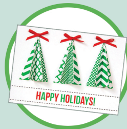
paper cards no foil or electronics